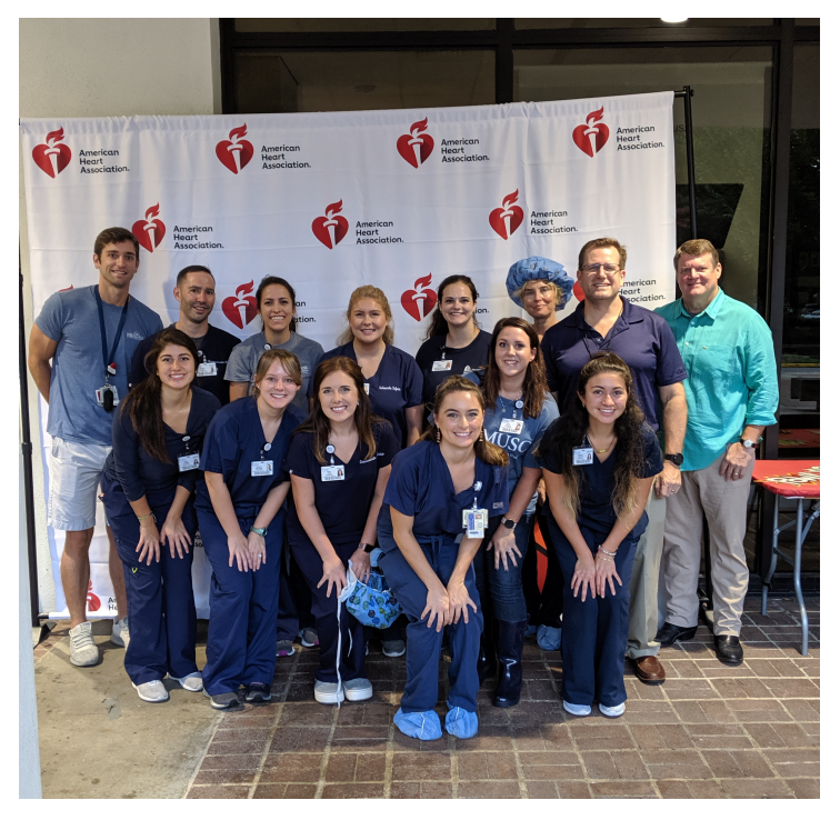
(left) Little Heart Hero patients posing with their families and the Stingray Hockey team mascot. (right)Little heart Hero Day/PSPS volunteers.